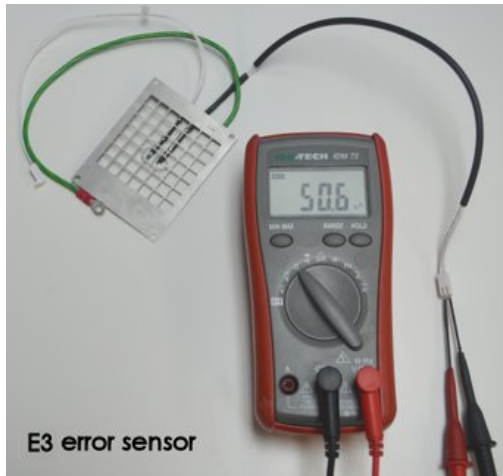
E3 error sensor